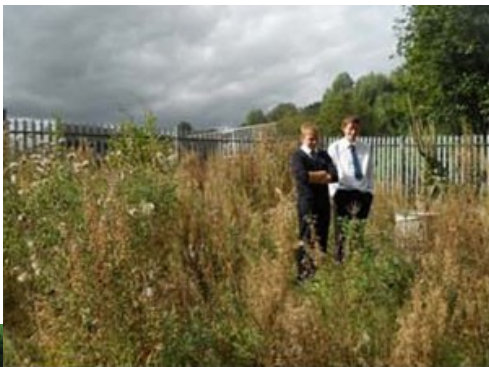
Allotment before (left)